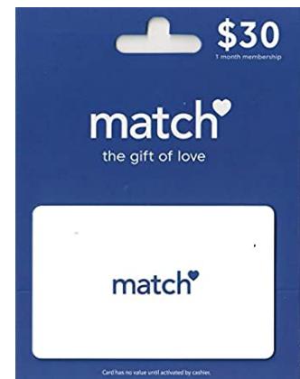
Consumers can buy Match.com gift cards at local retailers using the payment form they want

This can all be done without any involvement of the Apple and Google stores, so the argument that there is a "monopoly" on payments is false.