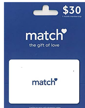
Consumers can buy Match.com gift cards at local retailers using the payment form they want

This can all be done without any involvement of the Apple and Google stores, so the argument that there is a "monopoly" on payments is false.