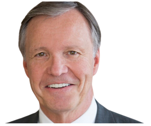
Section 230 co-author & former Rep. Chris Cox