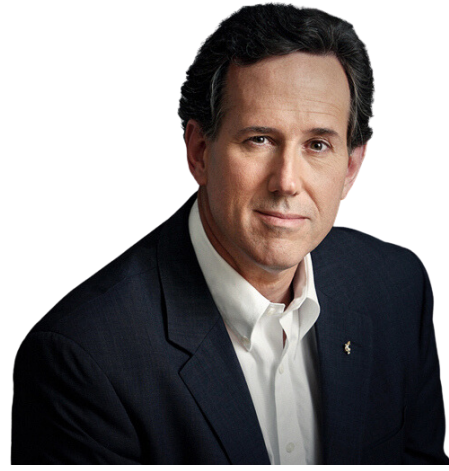
Former Sen. Rick Santorum