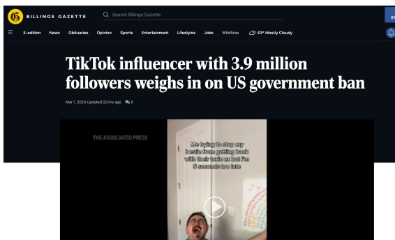
Billings Gazette showing an AP story about a TikTok influencer

What if a Montana business links to their TikTok account they use to get out-of-state customers? Are they going to be fined $10,000 for “aiding” TikTok?