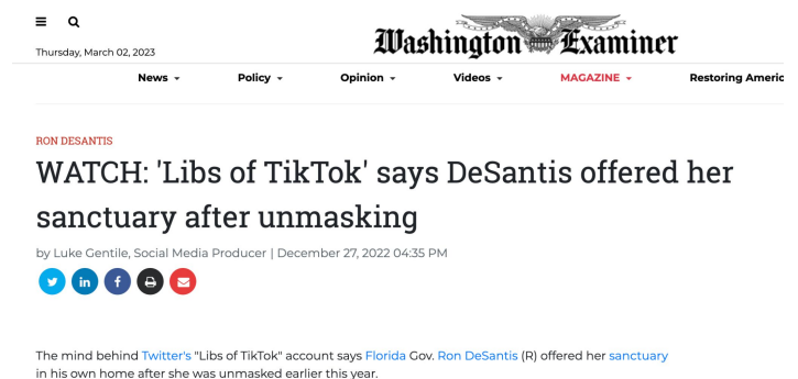
Washington Examiner story embedding TikTok content regarding DeSantis protecting LibsOfTiktok