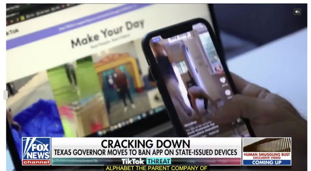
Fox News showing b-roll of live TikTok videos